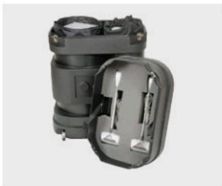
d400 package in transport case VA8056

VA 5843 P1, 1 x VA 1240, 1 x VA 1214, 1 x E 275, 1 x E 185. Monitor not included in kit