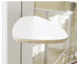
Display shelf VA 1214